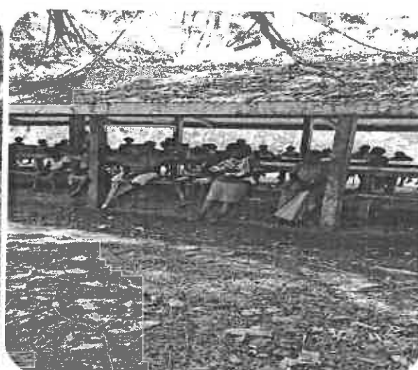
People of Bana at the Sovele Market

The Law & Justice team left Siwai at around 8:30am and arrived in Bana 10:30am Bougainville time. Presentations began at around 11:45am and ended at around 2:30pm.