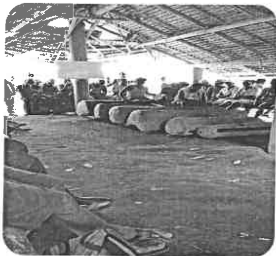
People of Siwai at the 'Kaposo' in Siwai

The audience which converged at the Chiefs' Meeting House was almost 90 percent.