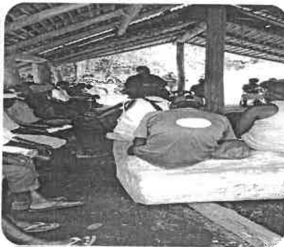
Asking Questions at the Roadshow