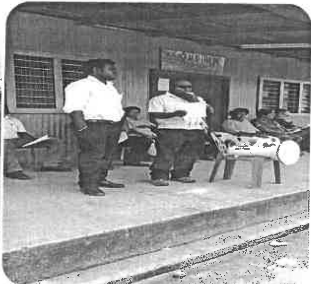
Agencies Presenting at the roadshow in Ruin