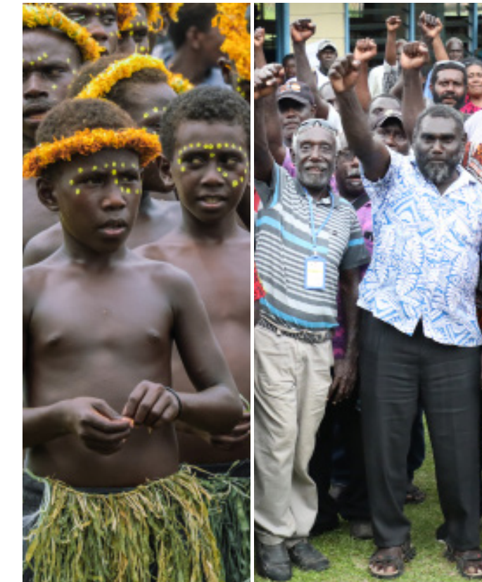
THE SECRETARIAT “Giving Voice To Bougainvilleans ”