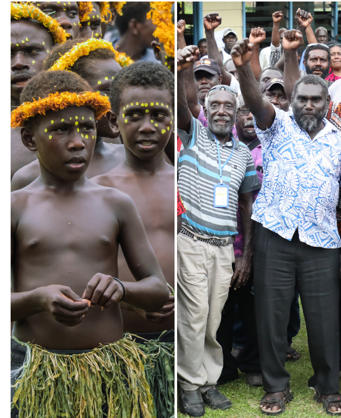
THE SECRETARIAT “Giving Voice To Bougainvilleans ”