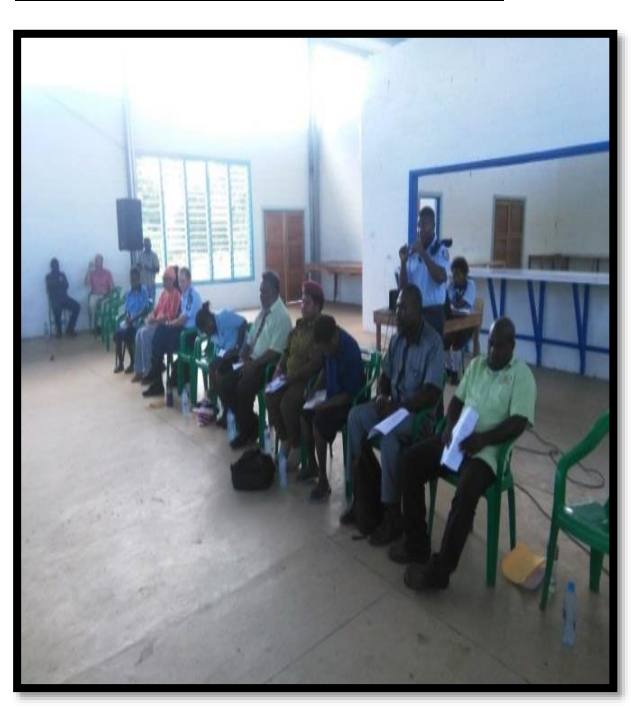
ASITAVI STUDENTS LISTENING TO THE PRESENTATIONS

BLJS TEAM PRESENTING TO STUDENTS AT ASITAVI