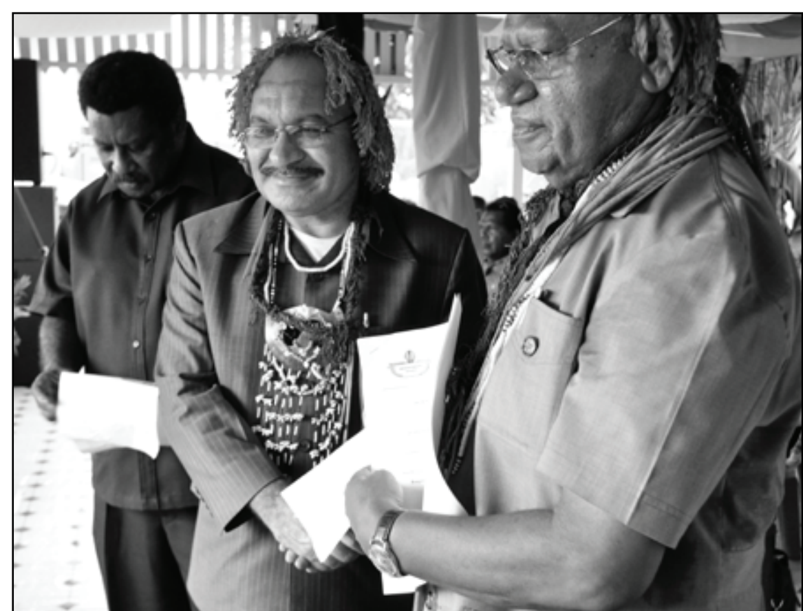
Joint agreement - Signing of the Memorandum of Understanding on a Joint National Awareness Program on the Bougainville Peace Agreement, 27 January, 2014 in Buka.

evaluate monitor and autonomy implementation.