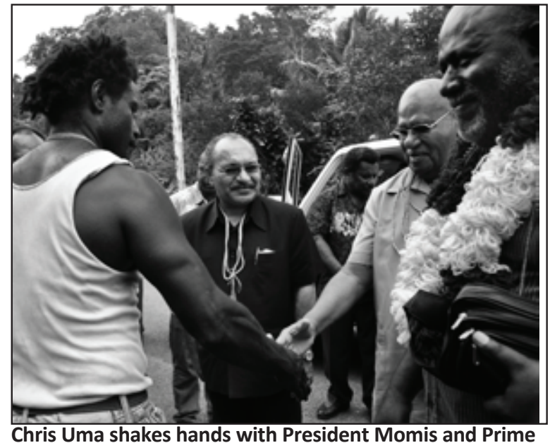
Minister O'Neill during the Prime Minister's visit to Bougainville, January 2014.

PPBS is planning to follow similar traditional mediation processes for the other two high ranking commanders (Toroama and Pipiro). It is also working on resolving the Siwai and Konnou conflicts. The peace building strategy is assisting ABG in strengthening unity across Bougainville in the lead up to the referendum.