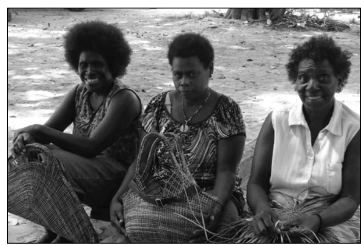
Haku COE weavers at the arts awareness workshop held by the Division of Information and Communications community engagement team.

Progress is also being made to restore Bougainville's once proud radio network and supporting New Dawn FM. The Government and NBC recently signed an MOU to upgrade NBC's facilities in Bougainville including the short wave transmitters and studio's. A major piece of this story is NBC has agreed to transmit up to 60 percent of local Bougainville content. ABG will produce the content that it wants broadcast.