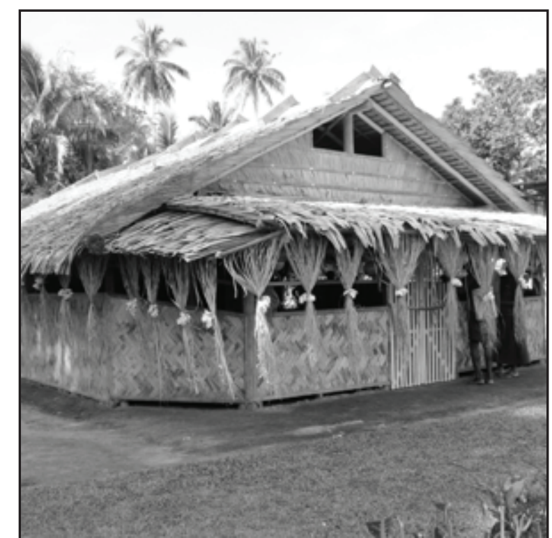
Bana baba Council of Elders Office