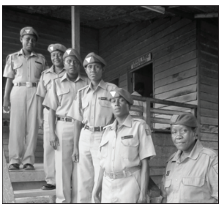
Beyond the call of duty - Despite no bed to sleep on or proper accommodation, these officers at Beikut Correctional Facility are committed to the job of rehabilitation.

through the Minister for Correctional Services, Hon. Jim Simatab, has