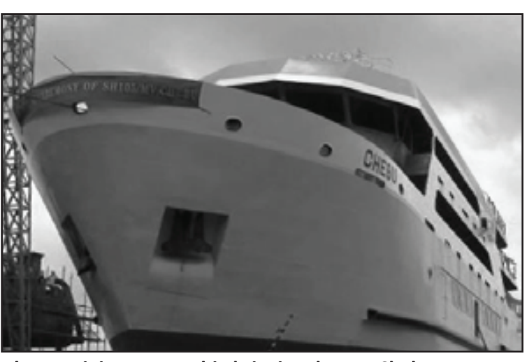
The new joint partnership bringing the MV Chebu to Bougainville is a good example of the Inward Investment Act

"This law is designed to protect Bougainville's interests and we are confident the law will do this. We urge our people to use the legal processes that are in place, and not take any independent action."