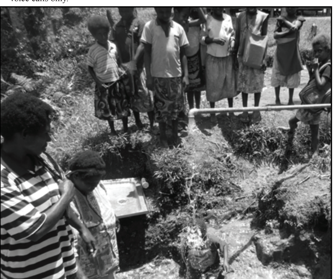
Sinkodo water supply