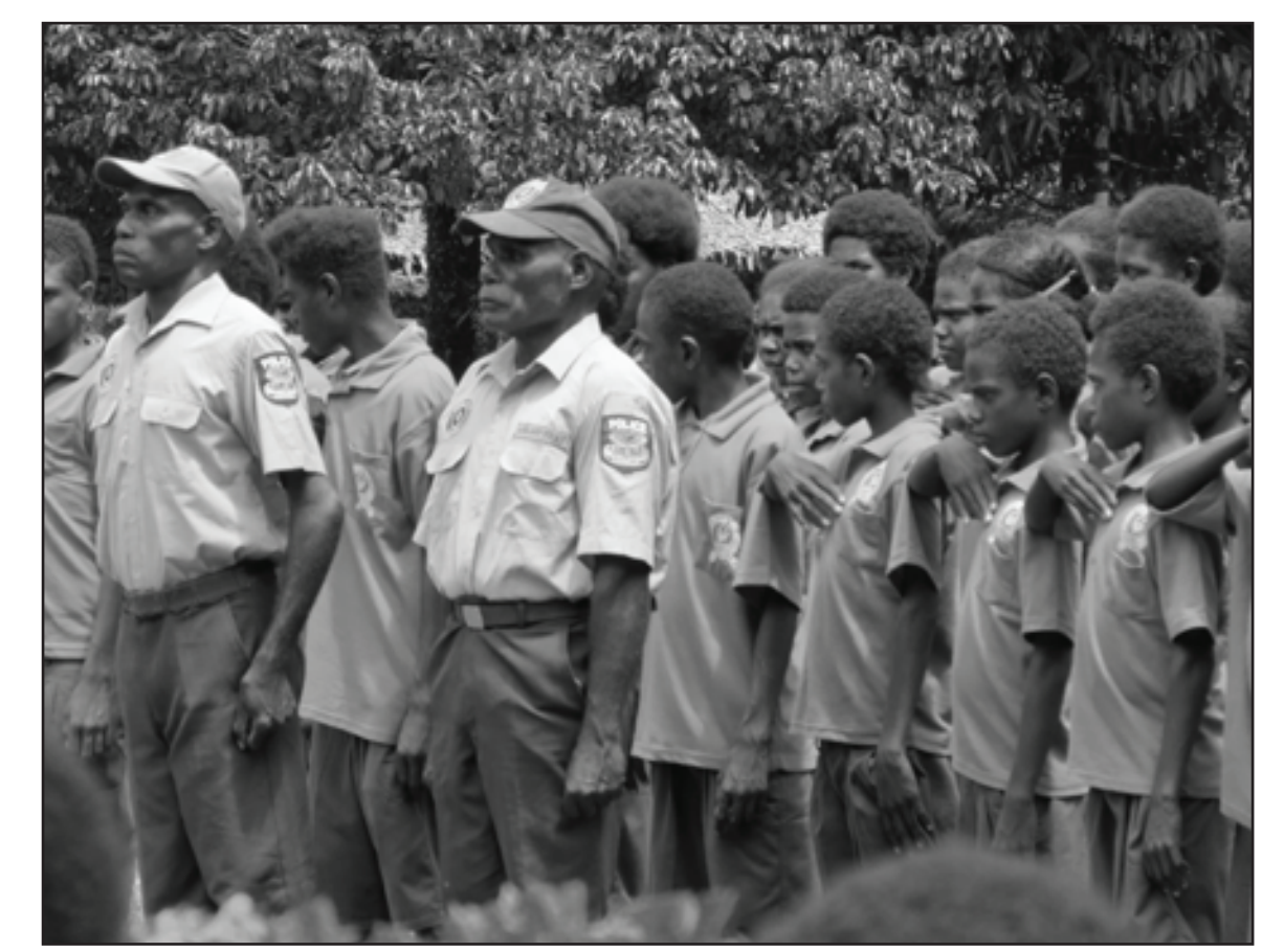
District Community Auxiliary Police Service and primary school students