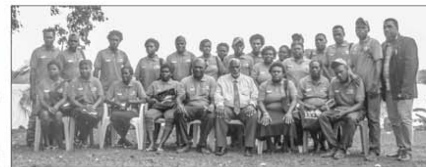
Participants of the Model Youth Parliament with the Speaker of the House of Representatives Simon Pentanu

ABG Departments, donor partners and stakeholders as well as the Bougainville House of Representatives were also