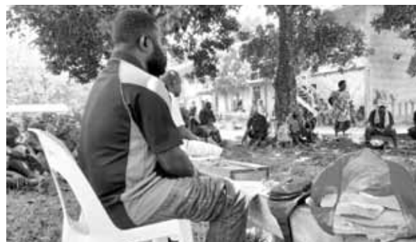
Ketsuarapa ward, Atsitsuli Ward & Paptana Ward meeting and consultations photos.