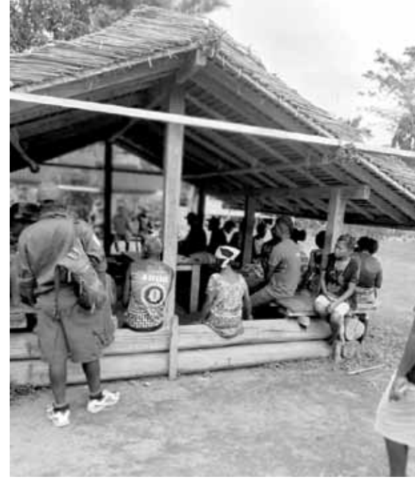
Koromaketo Ward Meeting and Consultations. Present were Chiefs, ward member, ex-combatants, youths and police