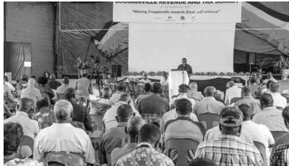
The 2017 Bougainville Revenue and Tax Summit hosted at Hutjena Secondary School.

"The Summit will provide a forum for key stakeholders including government, business communities, potential investors and other