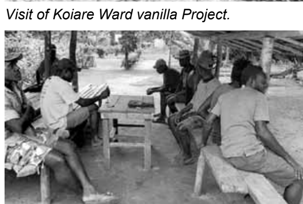
Atsinima ward meeting and first priority consultations.