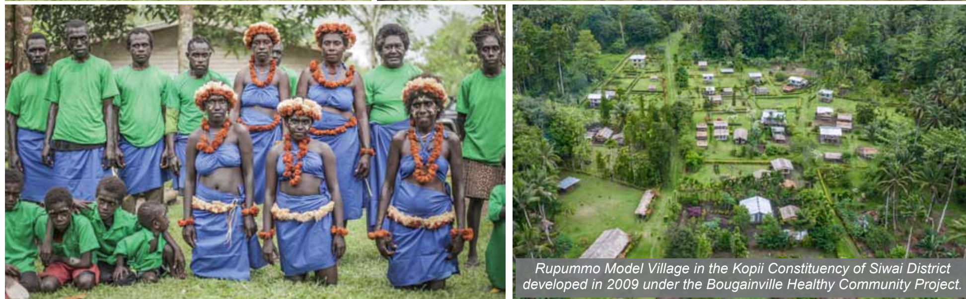
Rupummo Model Village in the Kopii Constituency of Siwai District developed in 2009 under the Bougainville Healthy Community Project.