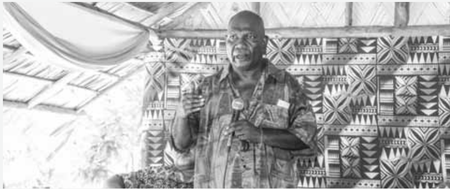
Hon. Ezekiel Masatt.

“The ground preparation is an extremely serious matter for Bougainville. We must not wait for the Government of Papua New Guinea to give independence on a golden plate. I challenge all elected members of this House not to wait for the consultation and the ratification to reach its conclusion. I plead with my fellow Members of this House to move as a matter of urgency in their constituencies.” –