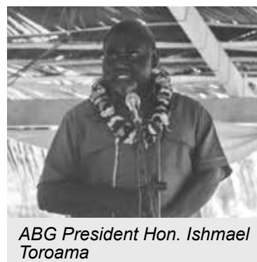
ABG President Hon. Ishmael Toroama

President Toroama further iterated that it