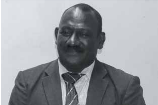
Hon. Bosco Ragu Minister for Police and Correctional Services

ABG Member representing North Bougainville Women Hon Amanda Mazono is the newly appointed Minister for Lands, Physical Planning, Environment and Conservation in the Autonomous Bougainville Government. Minister Mazono replaced former Minister and Member for Hagogohe Constituency Hon Robert Hamal Sawa.