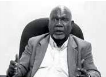
Ezekiel Masatt, Minister for Bougainville Independence Mission

The ABG maintains that ratification of the 2019 Bougainville Referendum on Independence will be done by the National