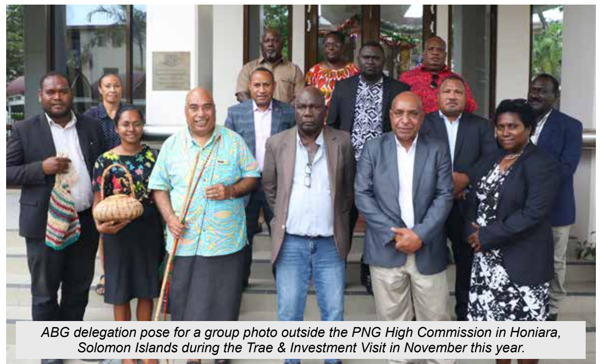
ABG delegation pose for a group photo outside the PNG High Commission in Honiara, Solomon Islands during the Trade & Investment Visit in November this year.

"As we reach out to the international frontier our focus must be on growing