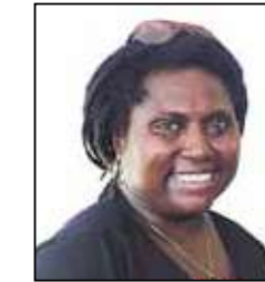
YOLANDE G. PAUL (Central Women's Regional Seat) Minister for Primary Industries & Marine Resources