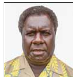
ROBERT HAMAL SAWA (Hagogohe Constituency) Minister for Lands, Physical Planning, Environment & Conservation