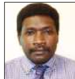
PATRICK NISIRA (Halia Constituency) Minister for Economic Development