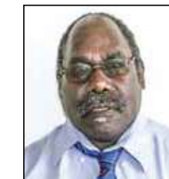
THOMAS PATAAKU (Ramu Constituency) Minister for Community Government