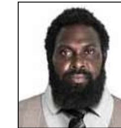
MELVIN WOLOLOPA (Lato Constituency) Minister for Public Service