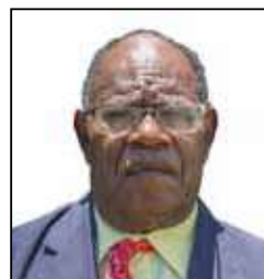
RAYMOND MASONO (Atolls Constituency) Minister for Health