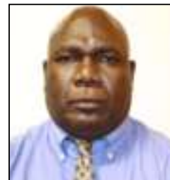
EZEKIEL MASSAT (Tonsu Constituency) Attorney General, Justice & Post Referendum