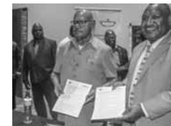
Dr. John Momis and Prime Minister James Marape at the recent JSB Meeting in March this year.

This will then be presented through a report to both governments immediately after the ABG 2020 general elections.