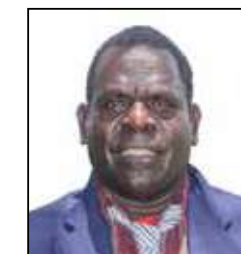
JOSEPH KIM SWUAMARU (Kopi Constituency) Minister for Technical Services