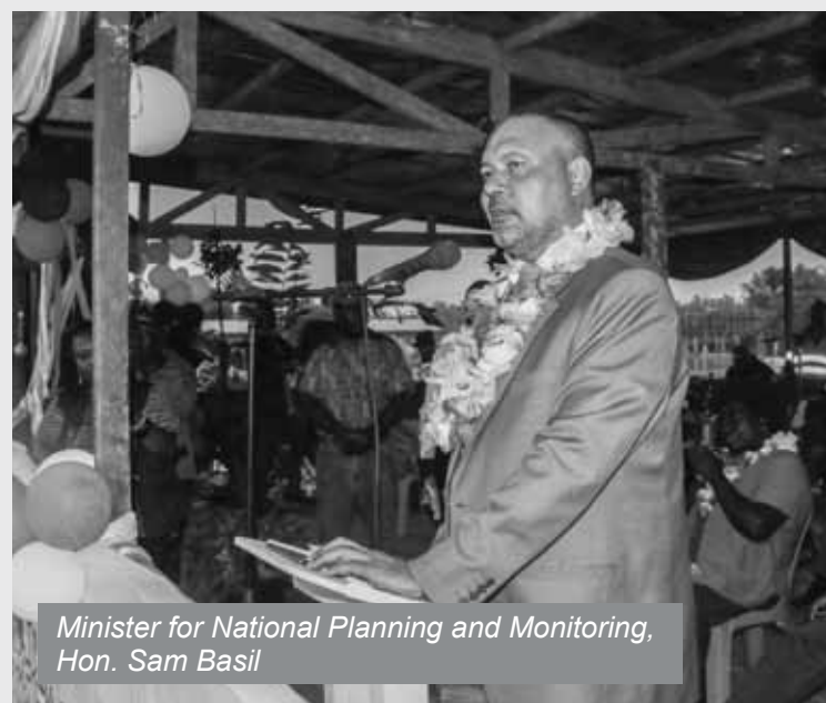
Minister for National Planning and Monitoring, Hon. Sam Basil

He said this demonstrates a positive response to the requirements of