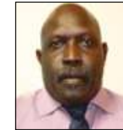
RODNEY OSIOKO (Kokoda Constituency) Minister for Mineral and Energy Resources