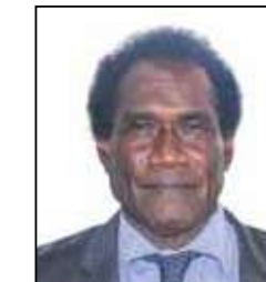
MATHIAS SALAS (North Nasioi Constituency) Minister for Finance & Treasury