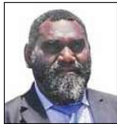
HON. ISHMAEL TOROAMA Minister for Inter- government Affairs, BEC and Media & Communications