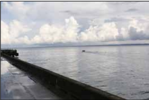
The Kangu beach - border between Bougainville and Solomon Islands.

The controversy on weapons disposal has been questioned again