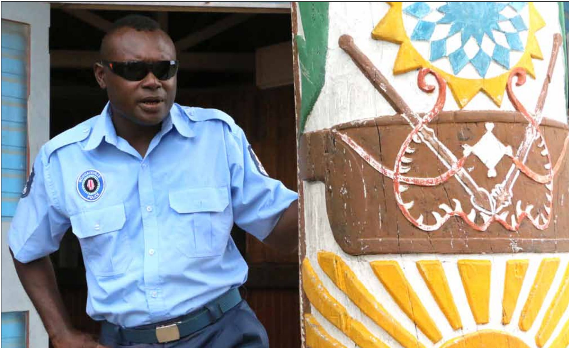
A police officer on guard during the ABG 2015 elections polling at Bel isi park.

As a government and as public servants we have the duty to make a real difference in the lives of all Bougainville citizens.