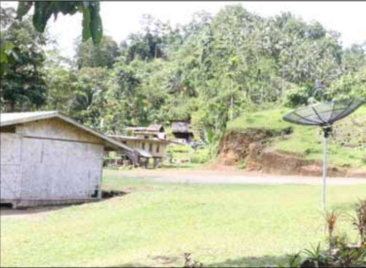
A satellite dish at Atamo Primary School.

The ceremony in local Kieta Nasioi tradition is a concept to pave way to forge peace between former enemies. The Bel Kol ceremony would signify that BCL and the Bougainvilleans are willing to reconcile and forge a new relationship based on trust. The Bel Kol is the first step before any discussions on negotiations on compensation by the company. In the Nasioi custom, there are five steps in the process. 1. Oko Takera : Putting the cause of conflict out in the open 2. Kare Kara: Chewing of betel nut 3. Ereng Si: Cleansing of the blood for both sides. 4. Osi Koing: arrival of enemy upon invitation 5. Narenang: Sorting out compensation This event would not be a forum for BCL and the PNG Government to pay compensation for reopening the mine but to set foundation for more discussions on the future of the mines. The Bel Kol is expected to pave the way for an invitation from the landowners for the mining company to open an office in Arawa in the future.