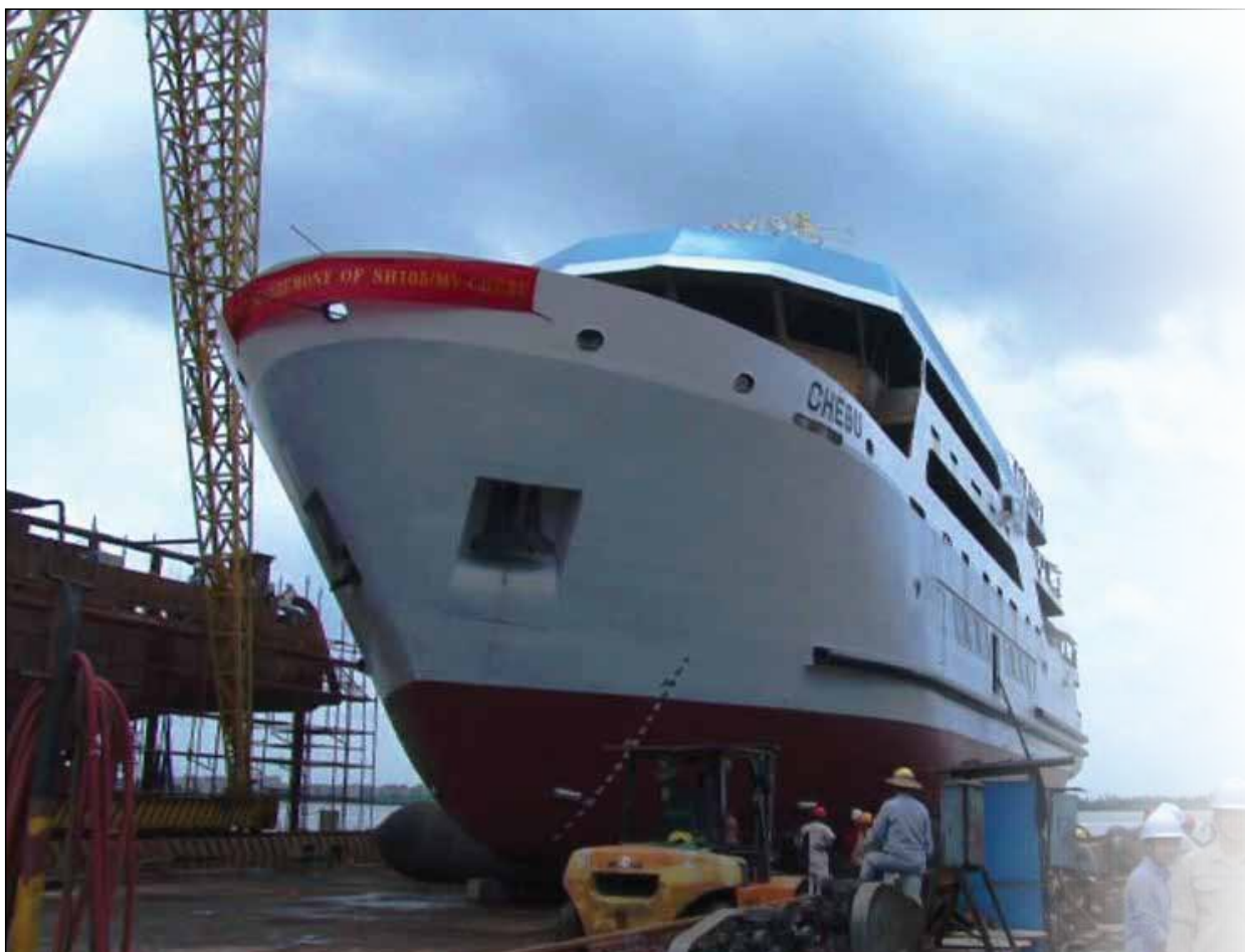
Mv Chebu em wanpla eksampol blong invesmen i kamap long Bogenvil

Long laspela edisen bilong Bougainville Bulletin, yumi bin toktok liklik long Bougainville Inward Investment Act na ol sections insait long em.